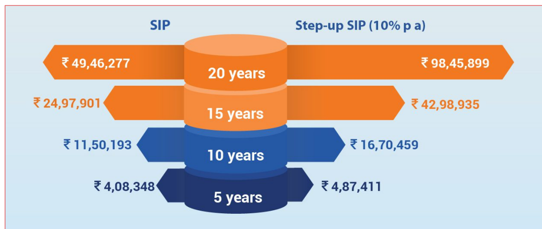
The above is only for illustration purpose.

Imagine you invest Rs.5,000 per month for 20 years; if your fund gives you 12% returns a year, you can make Rs.49.46 lakh from this investment. Now increase the SIP amount by say 10% each year and your return will be Rs.98.45 lakh! Not increasing your SIP amount makes you lose out on big amounts. Even if markets are turbulent, you should keep investing to take benefits of averaging out.