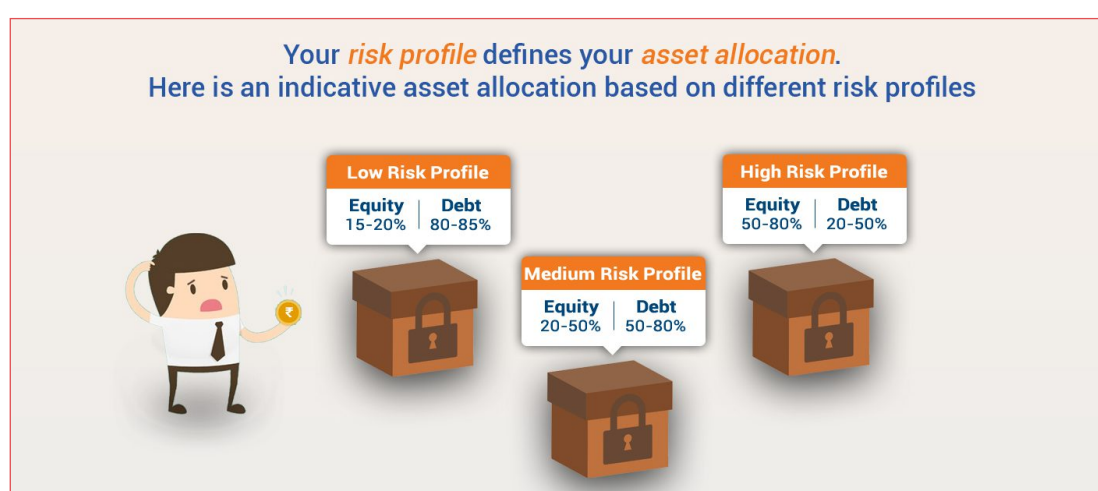
The above is only for illustration purpose.

Each one of us can take risk depending on our personal financial situation. Don't take more risk than you can manage; at the same time, don't shy away from risk. Both of these actions lead to disappointment.